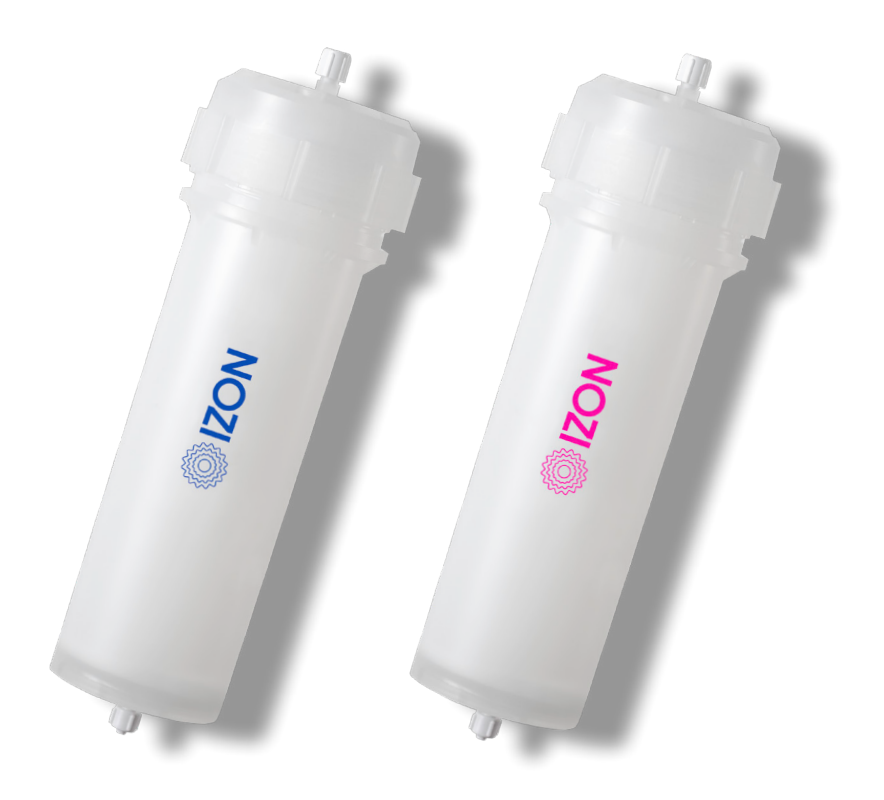
Figure 1. The qEV100 Gen 2, capable of running 100 mL samples. Like all columns in the qEV range, qEV100 Gen 2 columns are available in two types: the 35 nm Series (left, provides optimal recovery of particles in the range of 35-350 nm) and the 70 nm Series (right, provides optimal recovery of particles in the range of 70-1000 nm).